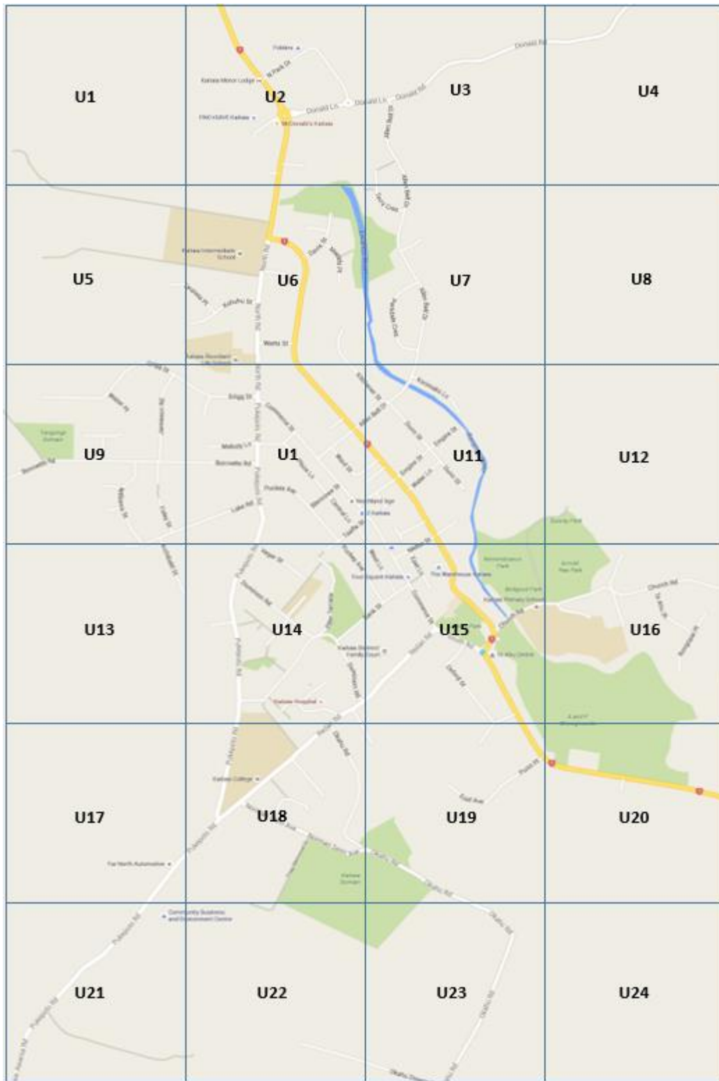
Figure 1: Example – creation of area units using a regularly spaced grid