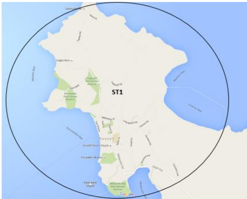
Figure 3: Example – creation of area units, where each small town is a separate area unit